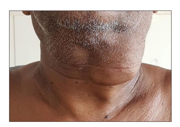
Figure 1. Clinical image of patient with neck mass.

Full list of author information is available at the end of the article.