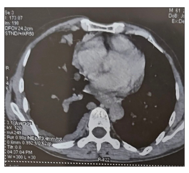
Figure 5. CECT thorax showing thoracic vertebra metastasis.