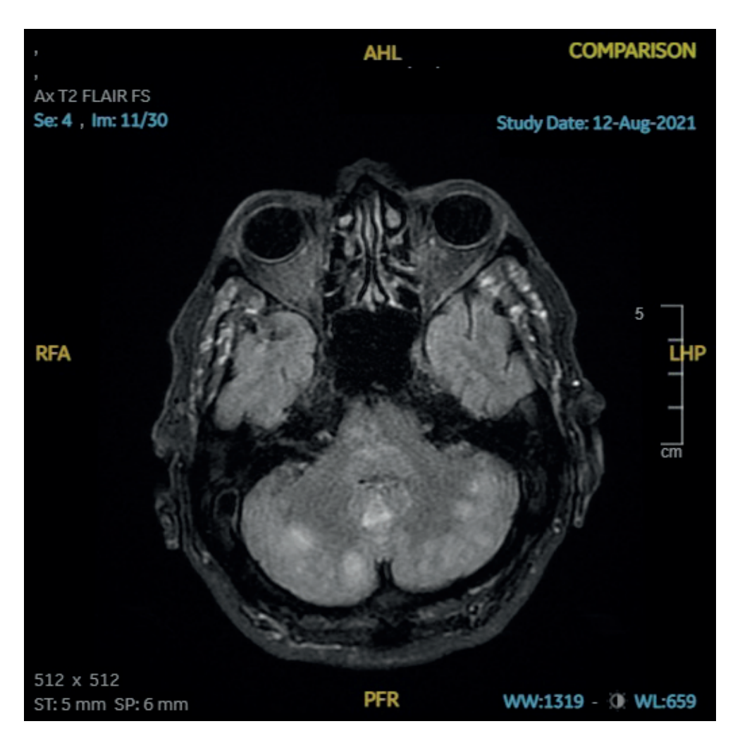
Figure 1. MRI showing bilateral T2 hyperintensities on FLAIR sequences in the cerebellum, parietal, and occipital lobes.

alveolar basement membrane develop. These antibodies are directed against an intrinsic antigen in the basement membrane. This results in a rapidly progressive glomerulonephritis with or without lung involvement that results in lung hemorrhage. Anti-GBM disease is rare, estimated to occur in fewer than two cases per million population [1]. Studies report both temporal and spatial clusters of cases suggesting the role of environmental triggers for the disease [2,3].