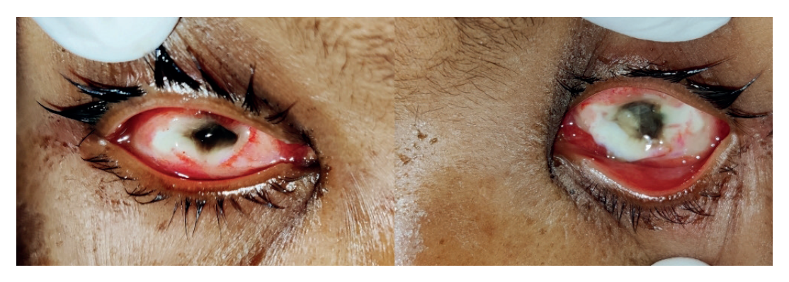
Figure 3. Bilateral Corneoscleral melting after auto-evisceration on next day.

antibiotics, antifungal, and cycloplegic drugs for the ocular condition. Repeat dilation and curettage procedure were also done for RPOC treatment and contents were sent for culture.