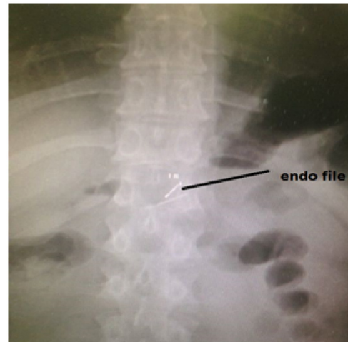
Figure 2: Shows endodontic file inside body.