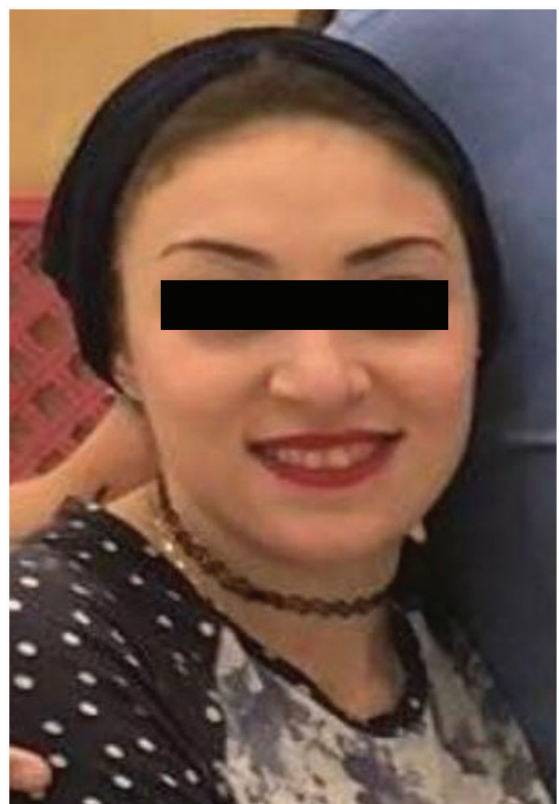
Figure 3. (a) A photograph showing hematidrosis from all over the face. (b) A photograph following subsidence of the episode.