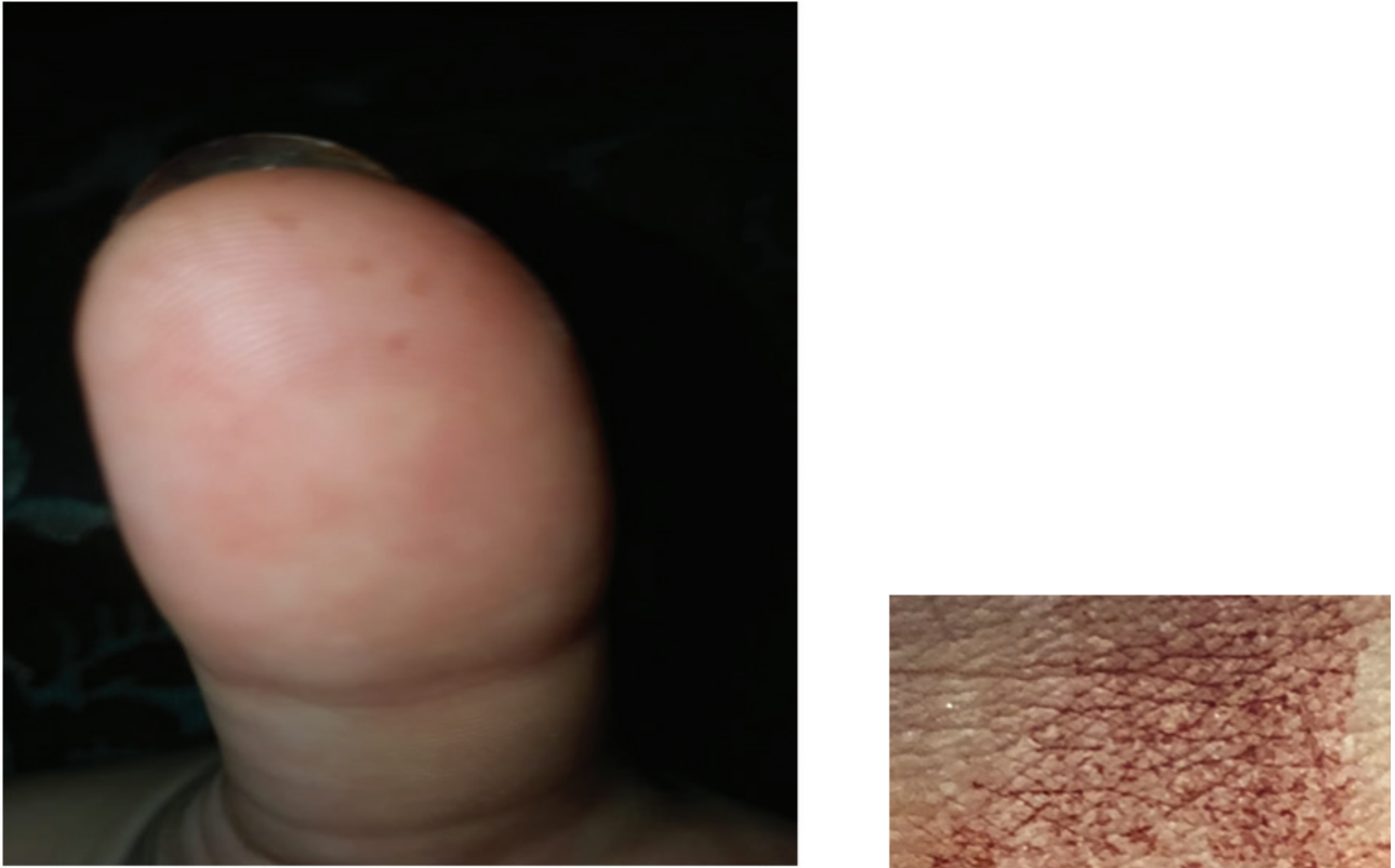
Figure 4. (a) A photograph showing hematohidrosis of the fingertip. (b) A magnified photograph of the fingertip.