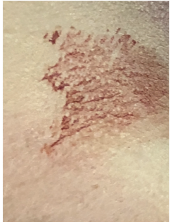
Figure 2. A magnified photograph of hematidrosis of the skin of the face.