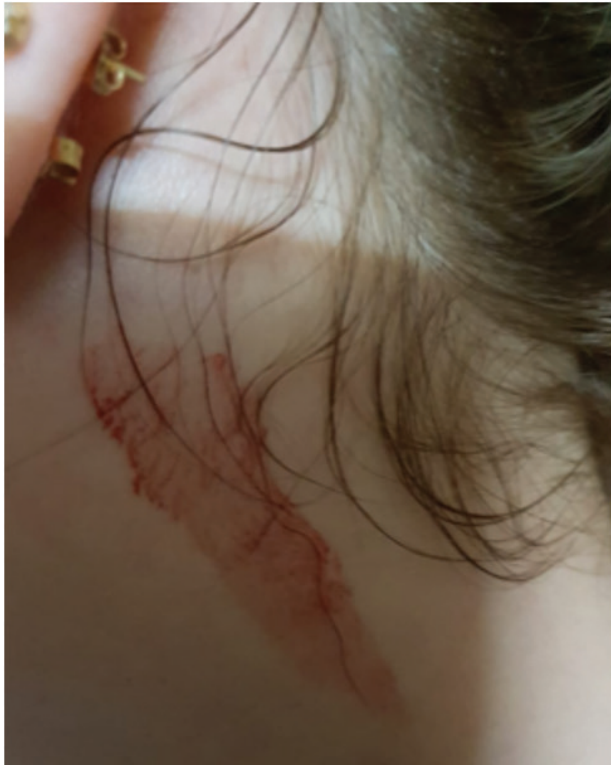
Figure 1. A photograph showing hematidrosis from the neck.