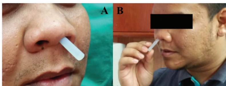
Figure 3. The patient demonstrating the technique of dilating the nostril by inserting the stick into the left (A) and right (B) vestibules.