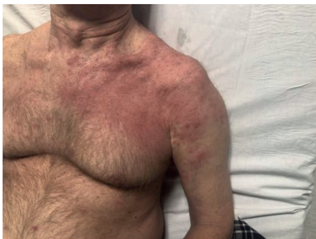
Figure 1. Day 1 of admission, day 5 after BCG.

consisted of fluid-filled <5 mm vesicles over the patient's left shoulder and upper lateral chest quadrant, in a C4 dermatome distribution (Figure 1). A consult was placed from the emergency room to the infectious diseases specialty service, which characterized the rash as VZV shingles reactivation. Patient was admitted for intravenous Acyclovir treatment, with rapid clinical improvement. He completed 3 days of intravenous treatment and was discharged in stable condition on clinical day 3 after marked clinical improvement (Figure 2), to complete the 10 days of oral therapy. Following doses of BCG were held, no evidence of recurrence was found on follow up cystoscopies after 4 weeks, 3 months, and 1 year. At 1 year follow