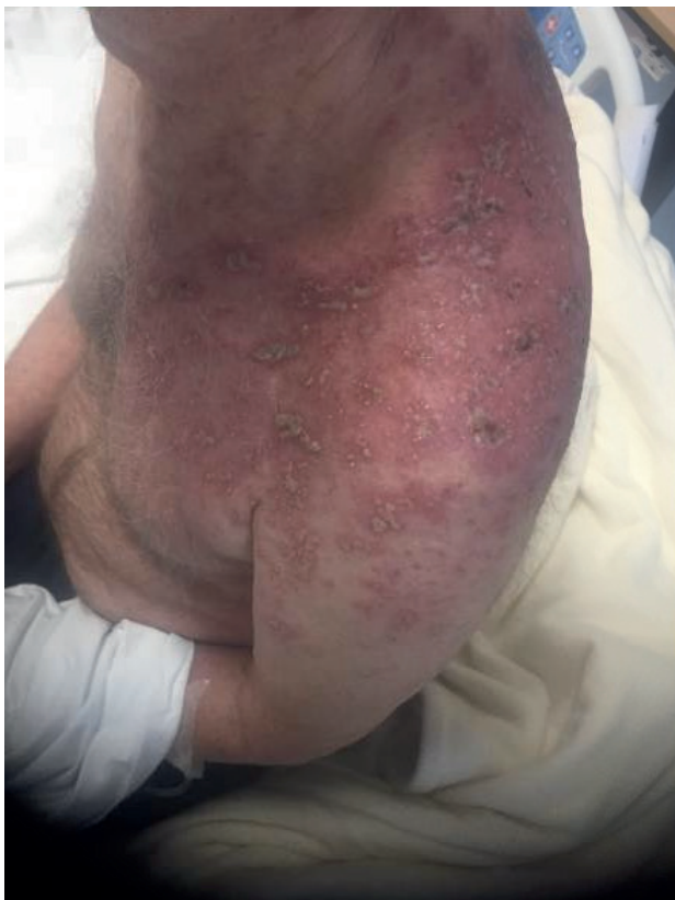
Figure 2. Day 3 of admission, day 8 after BCG.

up, patient reports scars and occasional pain and itching at the initial site of the rash which is further indicative of VZV shingles reactivation.