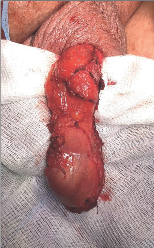
Figure 2. Homolateral testis and spermatic cord at the end of the procedure.