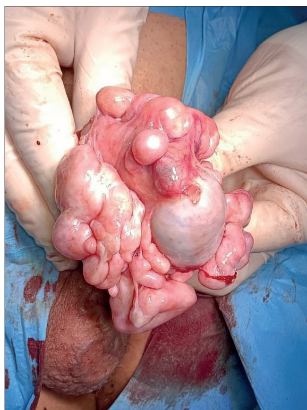
Figure 1. (a, b) Intra-operative view of the lesions.