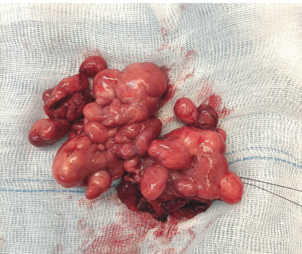
Figure 3. Epididymis affected by fibrous pseudotumor.

“fibromata”; in 1936, Thompson [11] published an extensive review on this subject while in 1963 Gibson [12] tried to classify the paratesticular tumors into those arising from the tunica vaginalis testis and those arising from the tunica albuginea testis. In 1997, Jones et al. [13] proposed a new