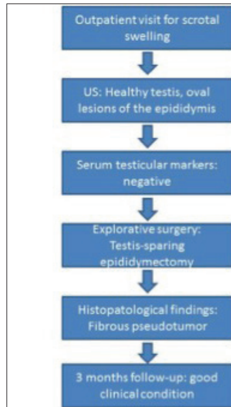
Figure 5. Timeline of the case.