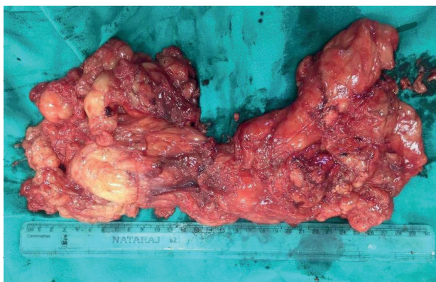
Figure 2. The large resected dumbbell-shaped fatty tumor.

An ultrasound-guided core biopsy of the mass lesion was planned to reach the diagnosis, which revealed a benign soft tissue lipoma. Thereafter under general anesthesia, successful resection of the mass lesion was done using the midline transabdominal approach without injuring the sciatic nerve (Figure 2). The mass lesion was encapsulated with only a few adhesions at the foramen sciatica. The histopathological examination of the resected specimen confirmed the diagnosis of a benign lipoma, as mature adipocytes were seen arranged in layers, separated by fibrous septa on hematoxylin and eosin staining, without any evidence of atypia, pleomorphism, lipoblasts, or mitotic figures (Figure 3). Subsequent to surgery, she recovered gradually and was discharged in healthy condition. The patient improved symptomatically gradually on follow-up and is now asymptomatic after 1 year of follow-up with regular pelvic ultrasonographic