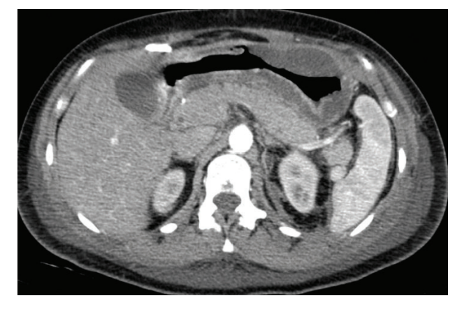
Figure 2 . Follow-up contrast-enhanced computer tomography of the upper abdomen showing a reduction in the gastric distention and thickness of the gastric wall and less free fluid.

fresh blood and clots inside the stomach, which had an extensive and deep ulceration on her greater curve, confirming the severely thickened and inflamed gastric mucosa.