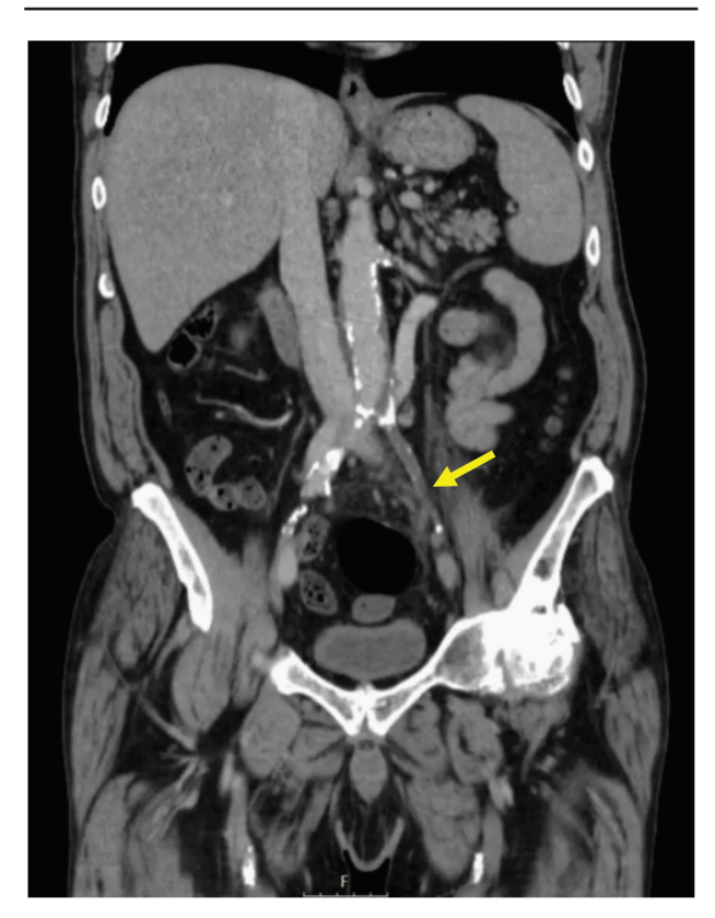
Figure 1. CTA scan (axial view) showing total occlusion of the aortobifemoral stent's left component (arrow).

and absence of all LLs arterial pulses, except for the right femoral pulse. Neurological examination to the extremities and perineal areas were normal. Abdominal and pelvic computed tomography angiography (CTA) scans revealed total occlusion of the aortobifemoral stent's left component, a prosthetic-duodenal fistula, as well as a local inflammatory/infectious process (Figures 1 and 2). The left deep femoral artery was repermeabilized by collaterals from the left internal iliac artery (IIA), via lumbar collaterals. On the right side, atherosclerotic stenosis of the superficial femoral artery and occlusion of the right external iliac artery were present.