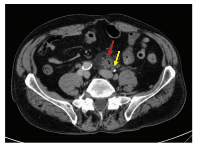
Figure 2. CTA scan (coronal view) showing total occlusion of the left CIA (yellow arrow), as well as a local inflammatory/infectious process in its length (red arrow).

After antibiotic treatment and surgical correction, the patient developed critical ischemia of the right lower limb (RLL), needing deep femoral artery thrombectomy and a bypass between the common iliac artery (CIA) and the right common femoral artery. One month later, in February, the patient was discharged. He was stable, with no pain, but presented an overall symmetrical weakness of all limbs (Medical Research Council [MRC] scale grade 3), with reduced tendon reflexes, in the context of Intensive Care Unit-Acquired Weakness. The remaining neurological examination was normal.