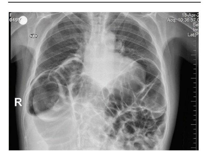
Figure 1. X-ray of the lungs and abdomen showed extensive meteorism at the upper quadrants of the abdomen due to enlarged bowel segments.

The radiogram of the lungs and abdomen showed extensive meteorism at the upper quadrants due to enlarged bowel segments (Figure 1). A computerised tomography (CT) scan of the abdomen revealed a massively enlarged spleen (22 cm in length) with numerous nodular hypointense lesions (the largest one is 2 cm in diameter) scattered throughout the organ parenchyma.