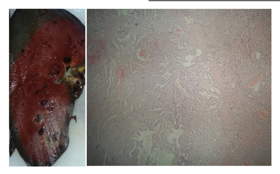
Figure 2. (A) Cut surface of the spleen revealed a dark maroon organ showing multiple well-delineated nodules without an evident surrounding capsule. These nodules are dark-red, dark maroon, or black (due to blood clots with different ages) with a maximum diameter of 2.0 cm × 2.2 cm located 0.8 cm away from the hilus. (B) The normal splenic parenchyma is replaced by cyst-like areas consisting of vascular anastomosing channels.

Gross examination of the spleen revealed an 870-g greyish-brown nodular organ measuring 20~\rm cm \times 12~\rm cm \times 6~\rm cm . The cut surface of the spleen showed well-circumscribed, locally cystic lesions throughout splenic parenchyma, which ranged from 0.7~\rm cm to 2.2~\rm cm in diameter (Figure 2A). The histopathologic evaluation identified multiple and anastomosing vascular channels lined by tall columnar endothelial cells. The lacunae