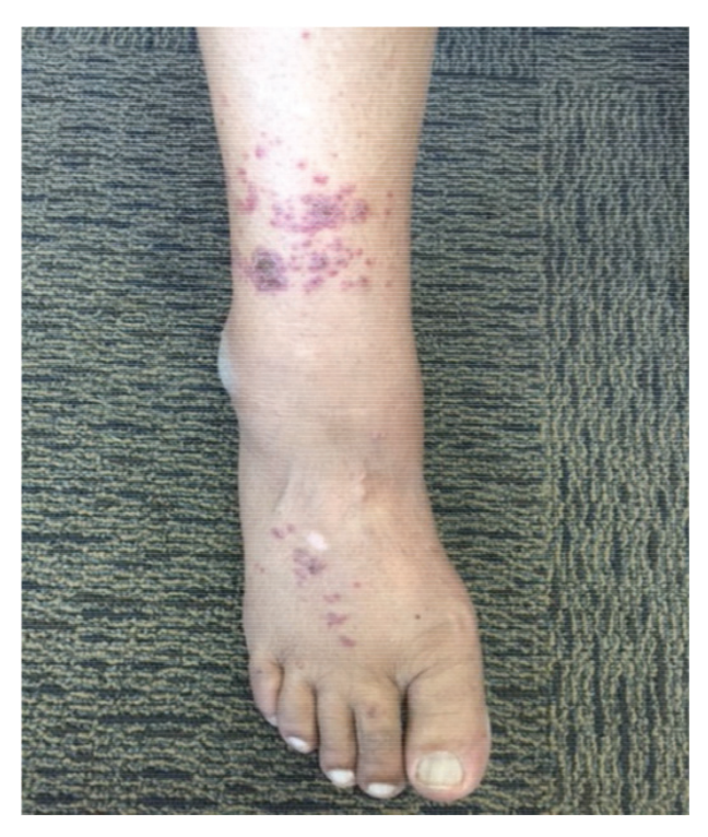
Figure 1. Peticheal lesions on the lower limb.

Insulin allergy is quite rare and there are no guidelines for managing these patients [1]. The clinical presentation can be very complicated as patients may be on multiple medications and there can be an overlap of multiple hypersensitivity mechanisms [1,2]. Presentation may occur several months or years after starting insulin therapy, or immediately after the first injection. Basal insulin glargine with short-acting analogues have both been utilized to treat insulin allergic patients [3-5]. This was the first strategy that was tried, unfortunately in the present case, reaction occurred to both glargine and all other available insulins. Patient was offered insulin desensitization as it is a good option for patients with multiple insulin allergies [6–8]. However, the patient refused to be admitted to the hospital. Subsequently, insulin was withdrawn, and patient was started on gliclazide MR and vildagliptin without any improvement in the blood sugar. The only insulin preparation that was remaining to be tried was IDeg. After initiating therapy with IDeg, there were no allergic reactions and the previous skin lesions subsided considerably. This may be due to the unique crystallized structure of IDeg which has the same amino acid sequence as human