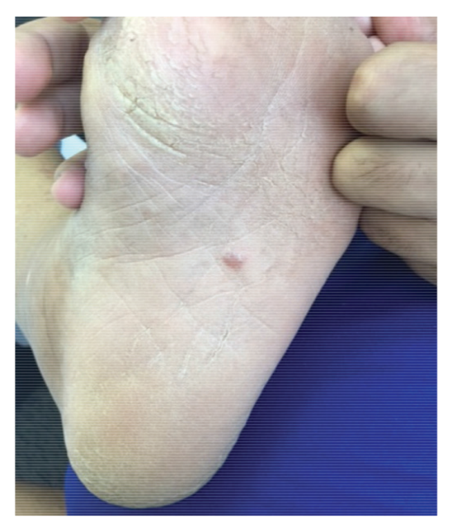
Figure 2. Vesico bullous lesions.