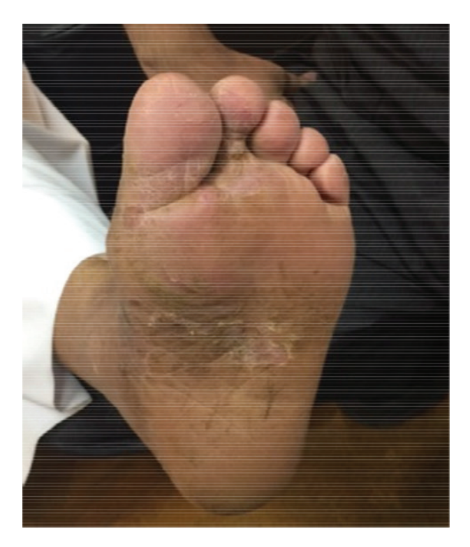
Figure 4. Healed lesion on the sole.

insulin except for the removal of threonine in the position 30 of the B chain and the attachment, via a glutamic acid linker of a 16-carbon fatty diacid (hexadecanoic diacid) to lysine in the position 29 of the B chain [9] (Figure 5). This alteration allows for the formation of multi-hexamers in subcutaneous tissues [10] which may have concealed its antigenic potentials.