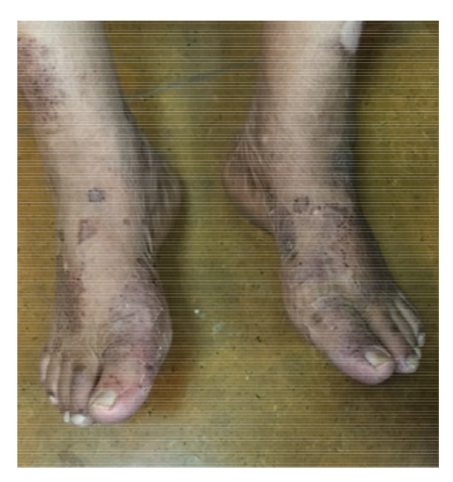
Figure 3. Healed lesions on the leg.